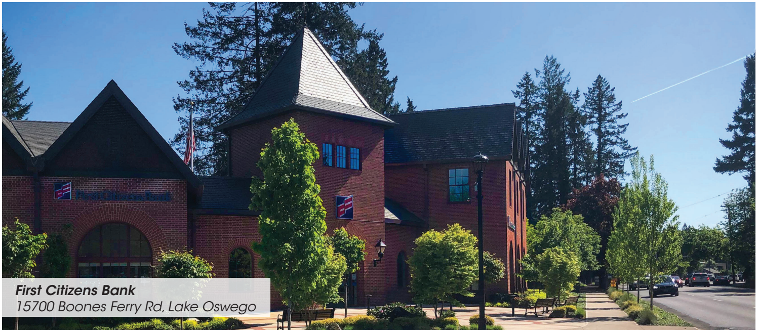
First Citizens Bank 15700 Boones Ferry Rd, Lake Oswego