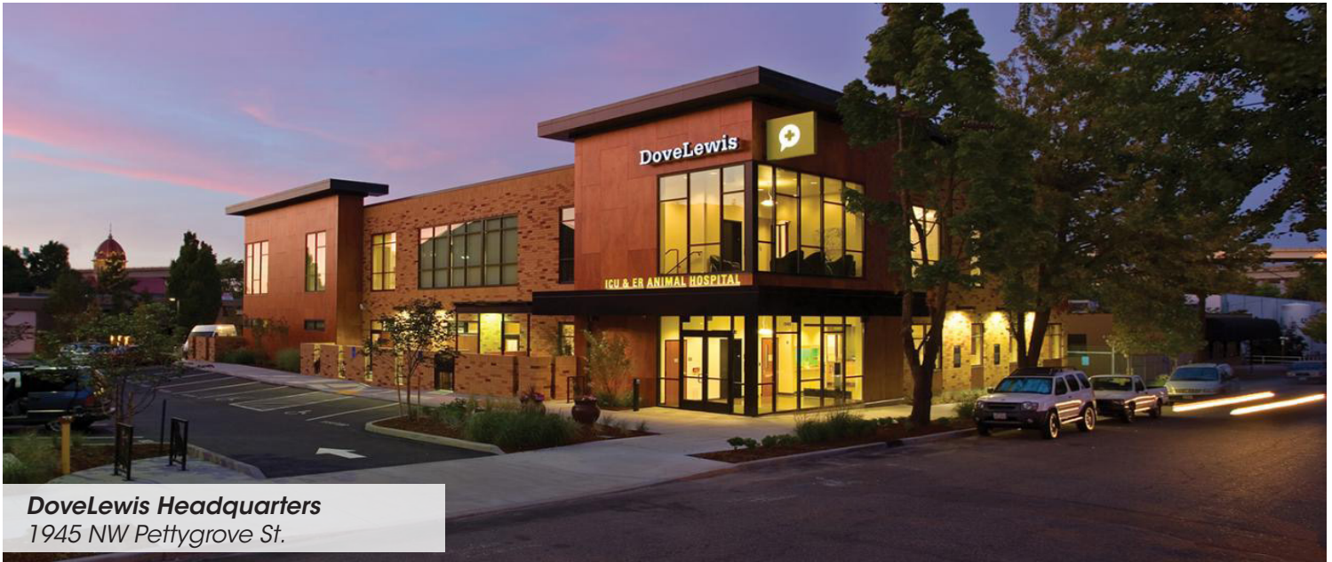
DoveLewis Headquarters 1945 NW Pettygrove St.