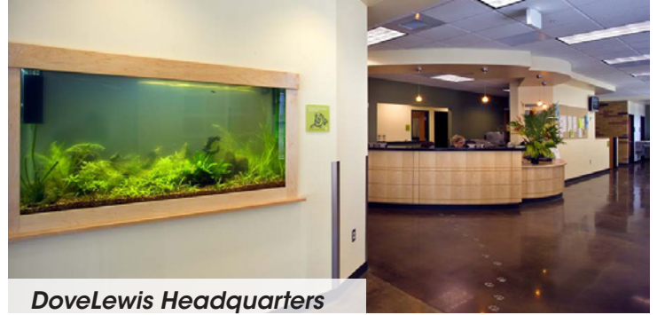
DoveLewis Headquarters 1945 NW Pettygrove St.

DoveLewis opted to split their clinical and administrative functions, allowing for the clinical function to expand into their current administrative space. Using our knowledge of the Northwest submarket, we identified available office space that was off-market, suiting their needs for employee parking, close proximity to the existing location, and room for growth. We also worked with the City of Portland to resolve an outstanding zoning/land use issue that prohibited expansion of the client's use in their existing location which secured their prime location for their facility for years to come.